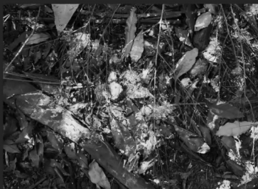
Whitewash (Owl poop!)

Look out for these as evidence of a Powerful Owl nearby