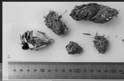
Pellets (Owl vomit/furball/bits they can't digest, like feathers, bones, fur)